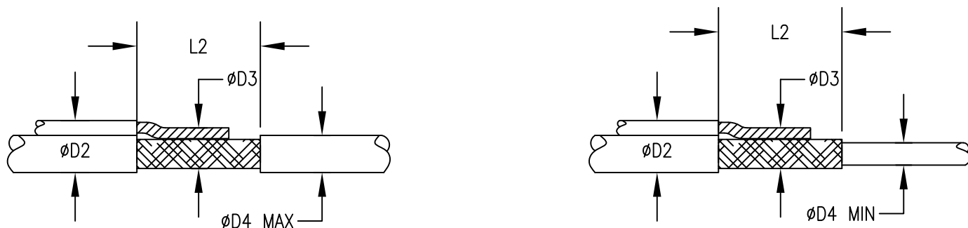
TABLE II: CABLE PREPARATION MEASUREMENTS