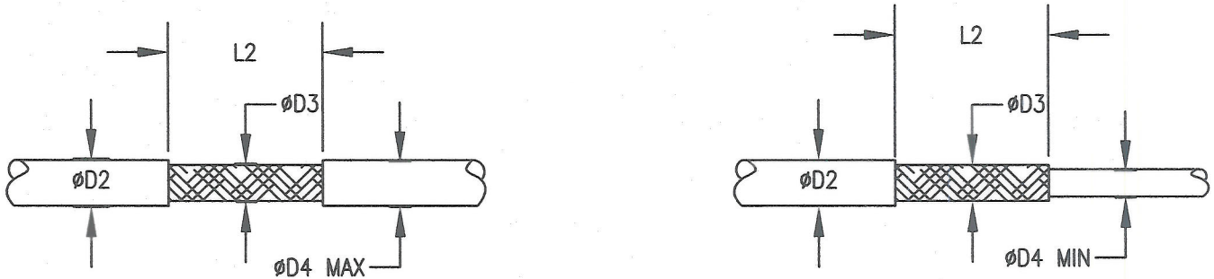
TABLE II: CABLE PREPARATION MEASUREMENTS